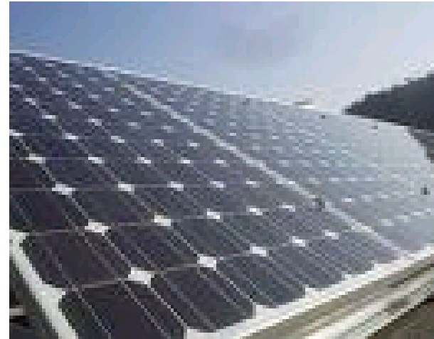
Italian Energy Industry

A Leading European bank providing specialized services according to customer needs