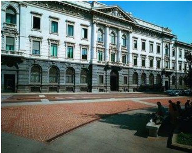
Intesa Sanpaolo Group